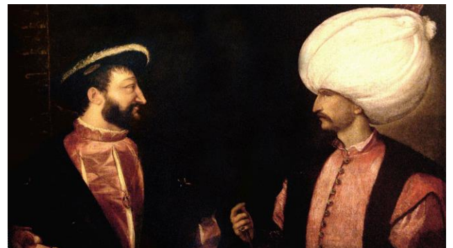
Francis I of France and Suleiman discuss the Franco-Ottoman alliance which begins in the 1530s.

How does Suleiman compare to the other 16 th century rulers (e.g. the Tudor kings of England) that you have studied?