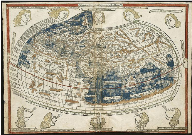
1482 edition of world map by German cartographer Nicolaus Germanus. Can you identify where Germany is on this map?

KEY INFORMATION: Malleus Maleficarum was written by Heinrich _____ and Jacob _____ in 1486, and was first published in _____. It translates from Latin as The _____.