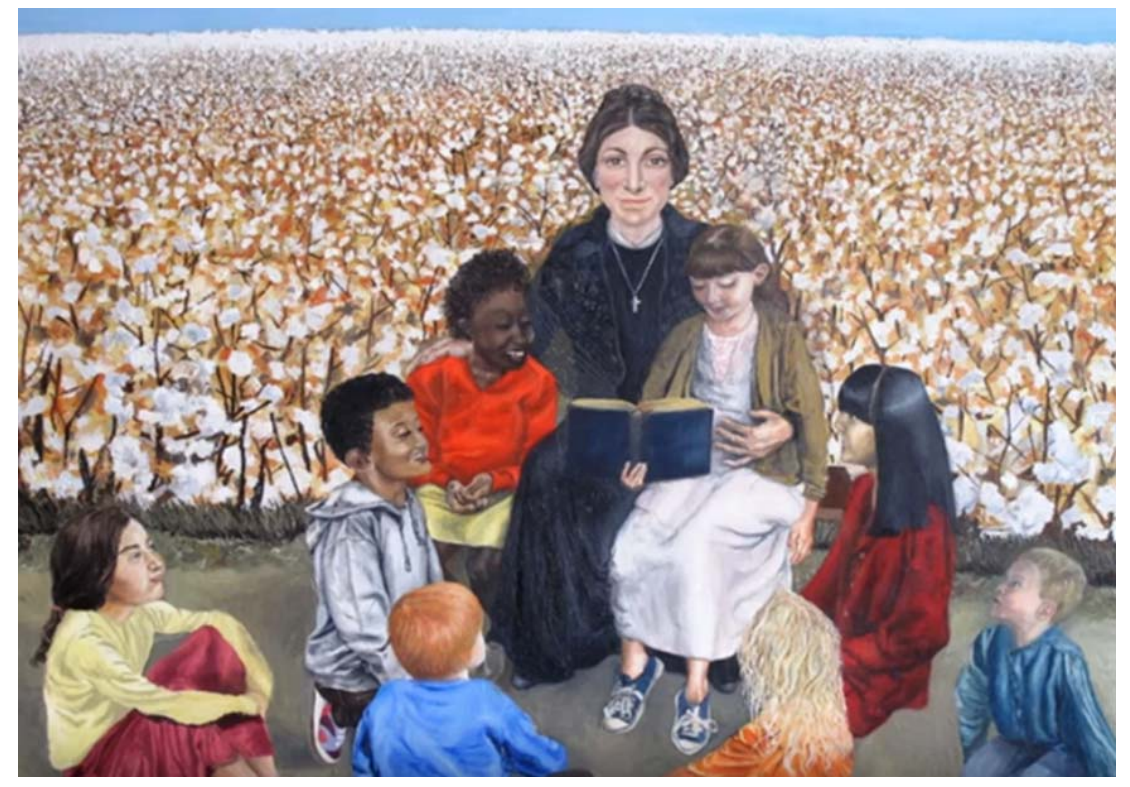
Painting by a pupil of Gumley school FCJ

20<sup>th</sup> – 24<sup>th</sup> September.