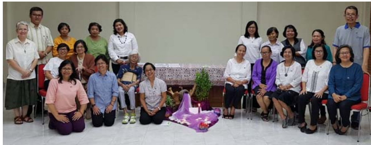
Some FCJ sisters and companions in mission in Indonesia

Companions in Mission (CiM) are a group of lay people who work alongside the FCJ Sisters in their mission. This is their prayer. We pray for all Companion in Missions around the world.